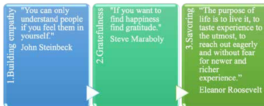
Figure 3. Three used techniques of Positive Psychology during research and quotes to support the techniques

Figure 3 explains the three key techniques of Positive Psychology. Given quotes reflect on the explaining these techniques. That would be crucial to reflect on building empathy, gratefulness, and savoring while mentioning positive psychology. Building empathy is one of the most necessary starter parts of positive psychology. People should develop a sense of empathy building – as this can assist people in developing a set of skills such as listening, taking action, and understanding individual self and others (Cherry, 2023). Positive psychologists mention that gratefulness is the key to happiness. The “cultivation” of gratefulness is the key to happiness (Giving thanks can make you happier, 2021). Savoring is the next step of positive psychology. Accepting the accident or trauma and perceiving this as a form of experience can help to build a positive resource (Tugade & Fredrickson, 2004). Empathy-oriented PPIs focus on strengthening positive emotions in interpersonal relationships. Healthy social bonds – on personal and professional