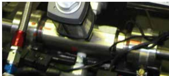
Figure 4. Device for compressible emulsion

According to test results of the emulsion obtained using the dynamic homogenization system, soot concentration in exhaust gases is reduced by 97%, and the level and rate of heat release increase by at least 35%.