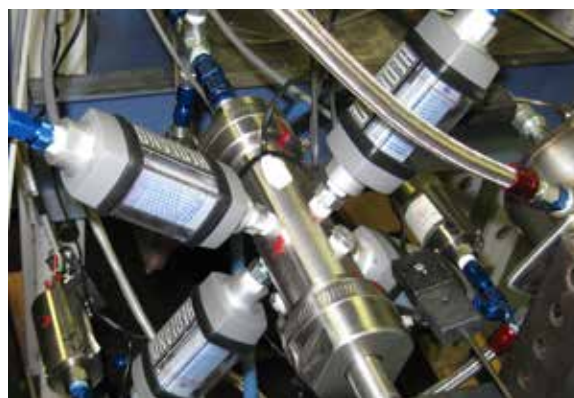
Figure 3. Device for compressible emulsion

Types of liquid hydrocarbon fuels that can be subjected to dynamic homogenization.