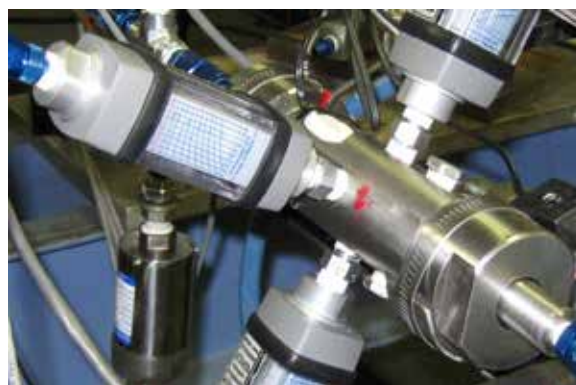
Figure 5. Device for compressible emulsion

and no structural modifications to the engine are necessary.